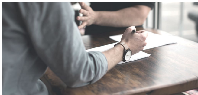
Exploring options of reporting.

In addition, Simplyhealth wanted to explore the option of reporting over specified periods of time to draw comparisons between current and historical time periods. Using the previous system, the process simply truncated the database and repopulated itself every time Carl's team refreshed, which at the time was once per week. Making comparisons with previous time periods – an important element of business reporting – was not possible.